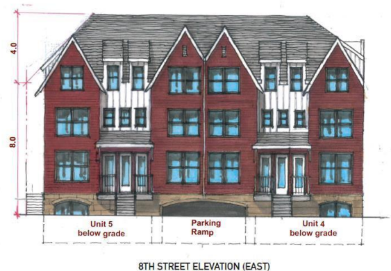
8TH STREET ELEVATION (EAST)