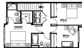
UPPER FLOOR PLAN = 653 SQ FT