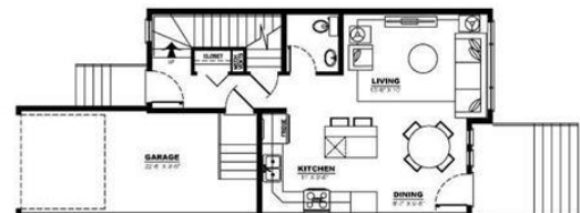
MAIN FLOOR PLAN = 537 SQ FT