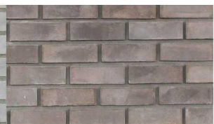
Selkirk - Contemporary Brick Brownstone